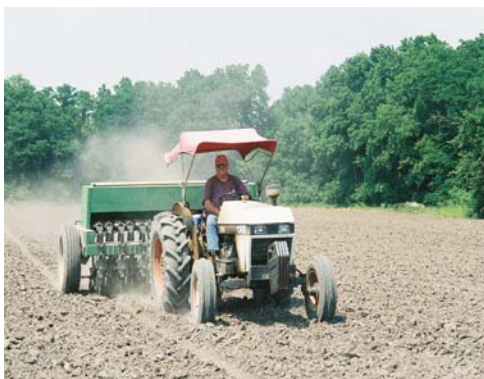
2007 Foods Resource Bank Warrensburg Growing Project